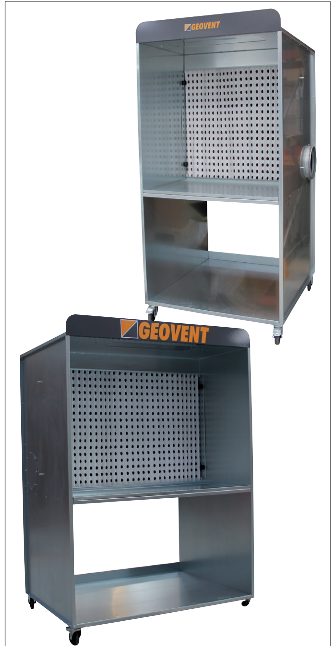
Spray booth for smaller items