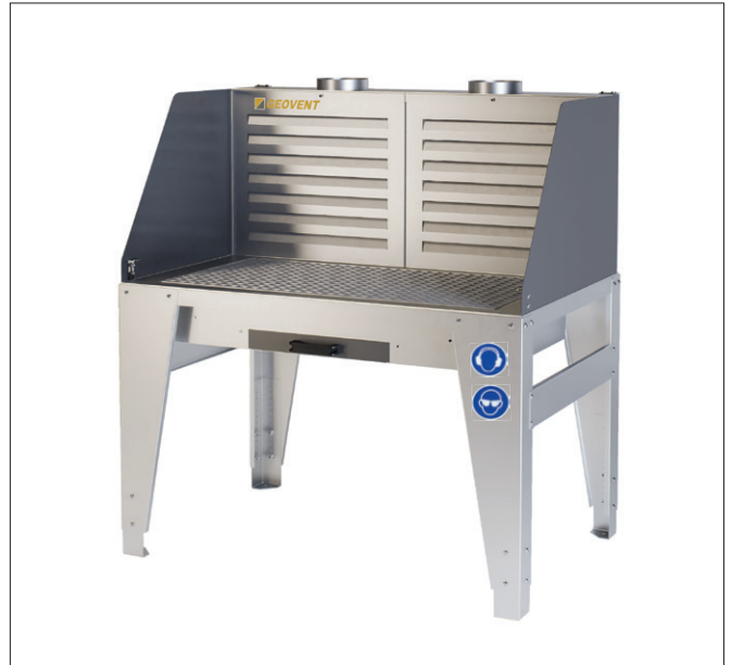
02-015 GT Ultra Welding and grinding table with grilles and drawer

The needed air flow for Ref. No. 02-015: 2000 m 3 /h.