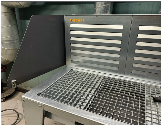
GT Ultra Welding and grinding table with swivel side panel